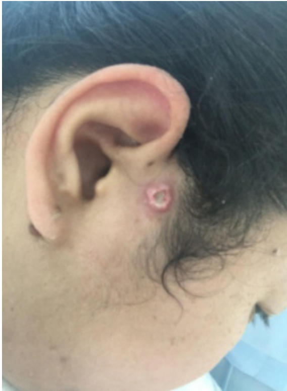
Figure 1 One week after incision and drainage with continuing clindamycin.